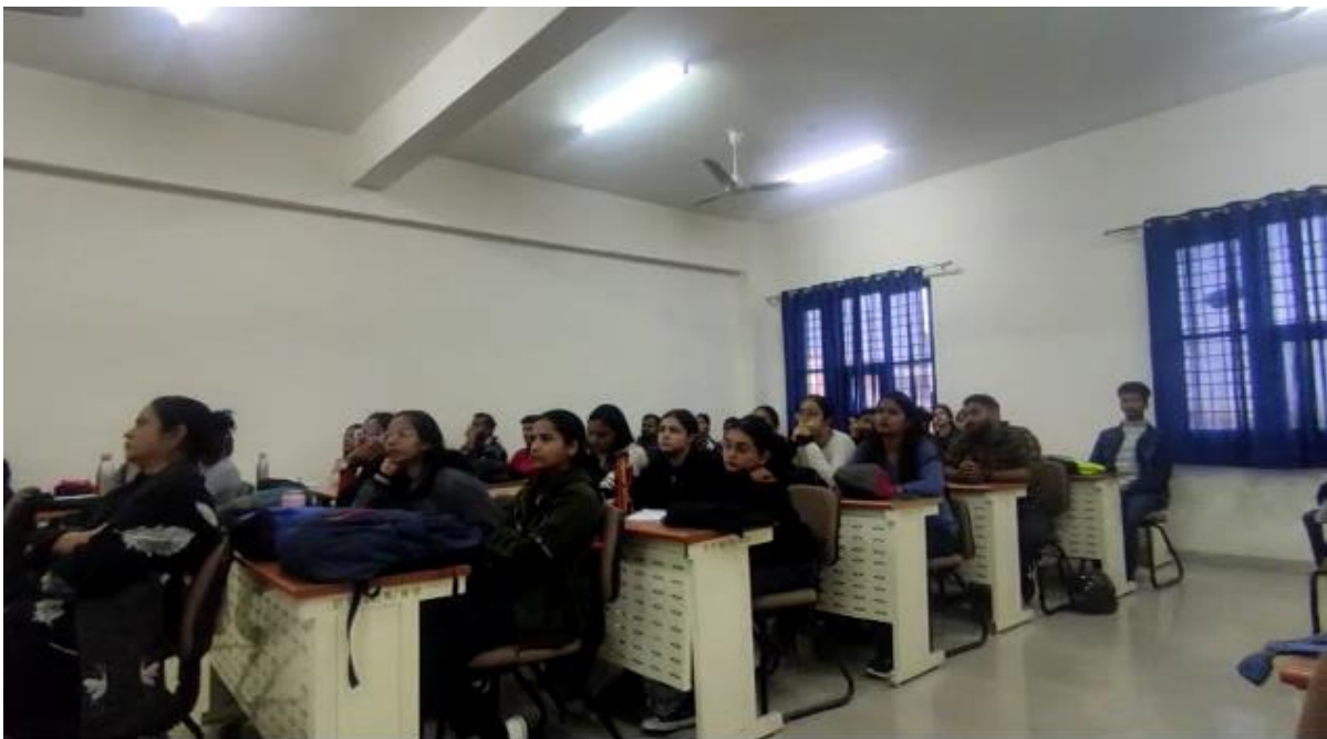
2. All the presented Students of SENR Department